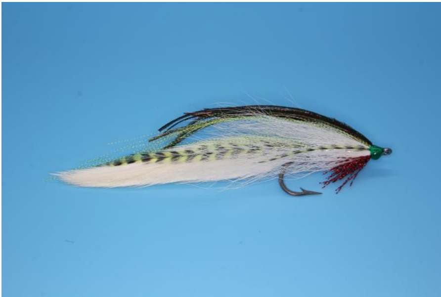
The Completed Lefty's Deceiver

Color the head with Green thread or use Translucent Green Solarez Bone Dry