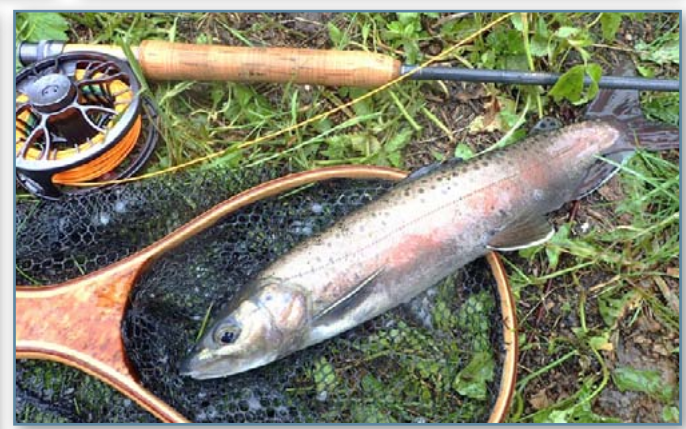
The northeast region is home to a variety of fish species such as the wild artic grayling, rainbow trout, pike and musky. It was evident that the rivers and streams supported a healthy population of insects, ranging from mayflies, caddisflies and midges.