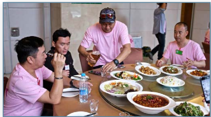
Finally, to conclude part one of the convention, the organising committee hosted the participants to a celebratory dinner with no expenses spared; from free flowing alcohol to a tuna-sashimi station.