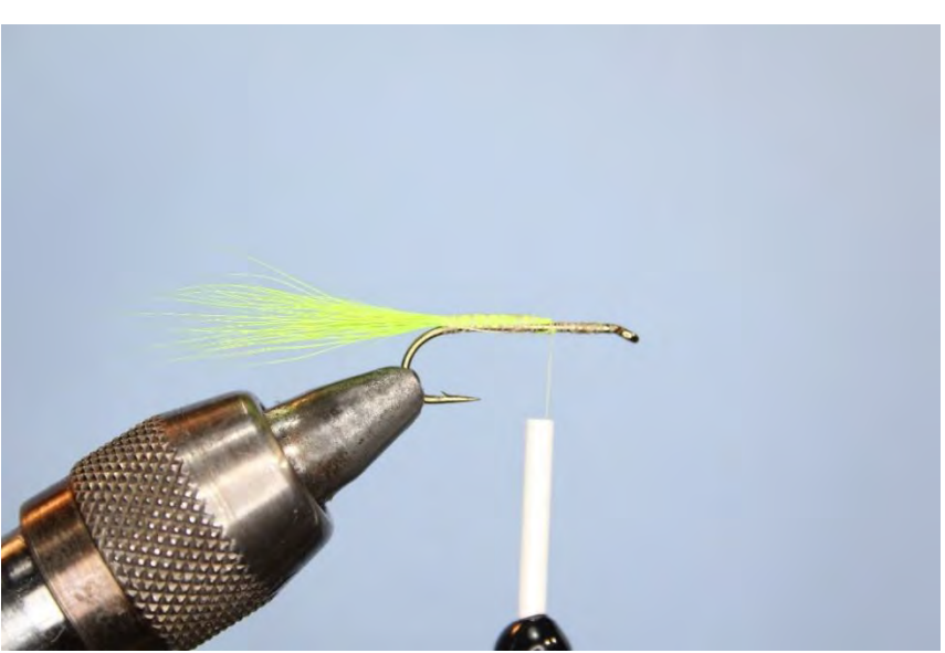
Step 5 Secure the bucktail to the shank of the hook.