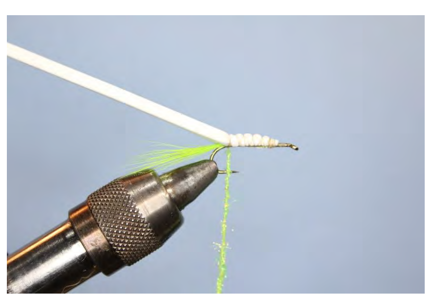
Step 8 Dub the body. Starting at the bend of the hook