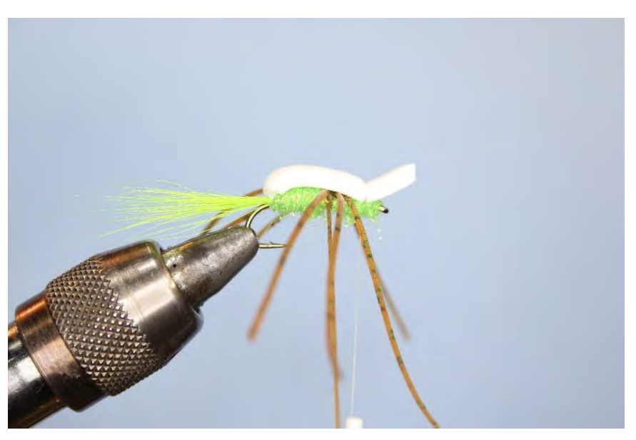
Step 14 Tie in the foam. Cut the foam leaving some of the foam sticking over the eye of the hook. Length is up to you for the action of the popping.