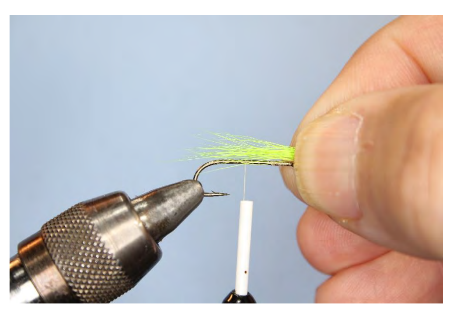
Step 2 Stack and measure the bucktail to be the length of the shank of the hook.