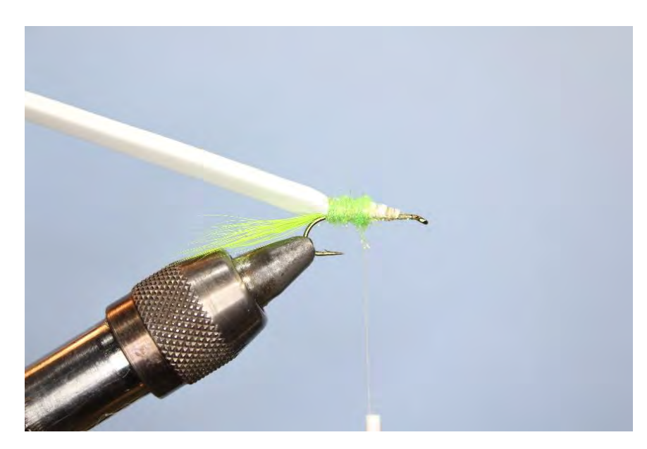
Step 9 Stop dubbing at the half shank point