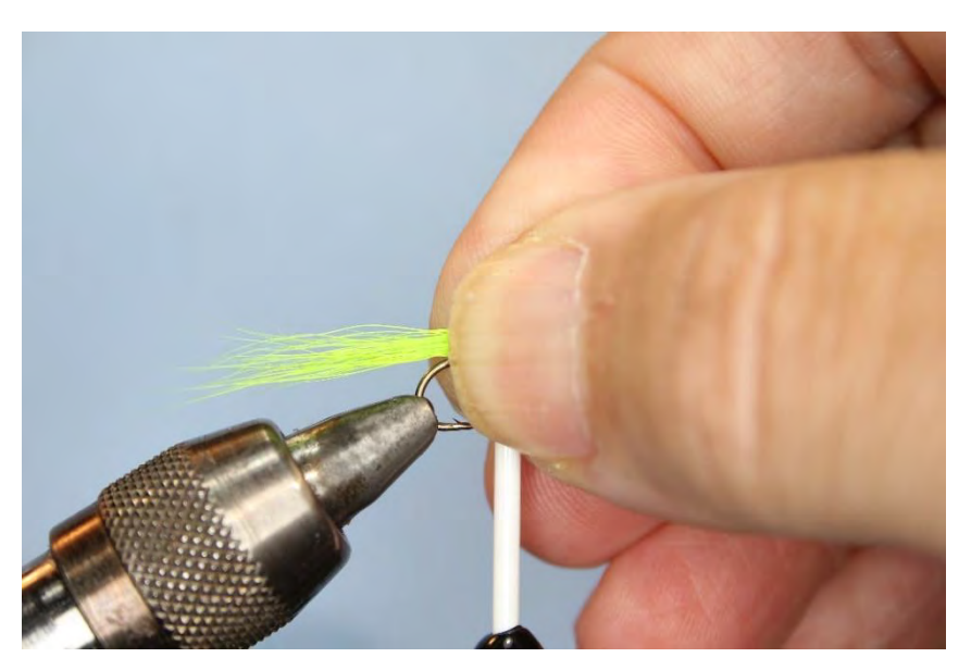
Step 3 Bring the bucktail to the bend of the hook.