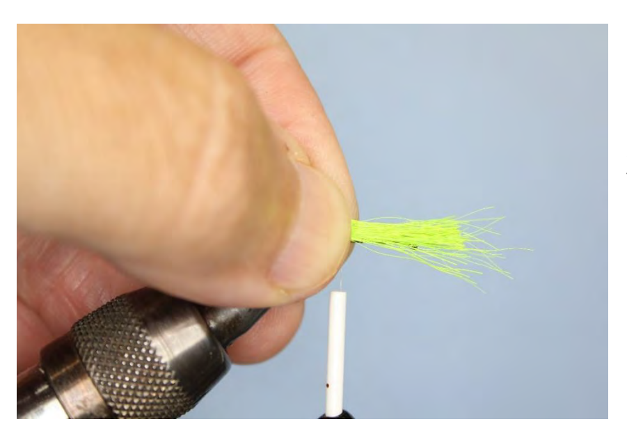
Step 4 Tie in the bucktail at the midshank point.