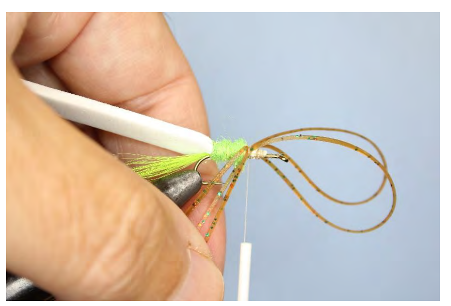
Step 10 Tie in the rubber legs at the half way point.