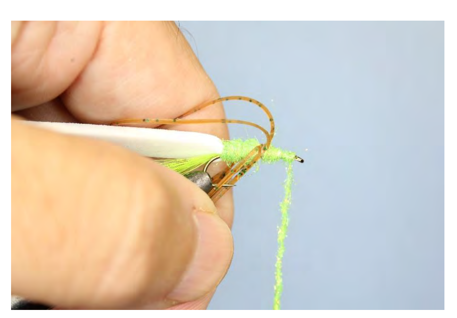
Step 11 Continue dubbing to behind the eye of the hook