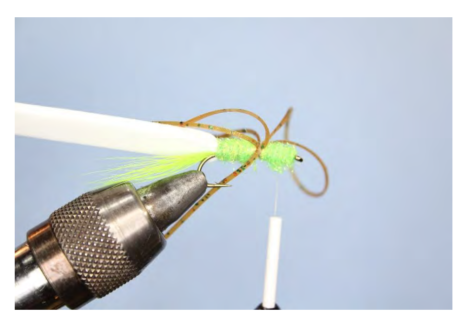
Step 12 Come back towards the bend of the hook with the dubbing. End at the 1/4 spot behind the eye. This is the tie in point for the foam