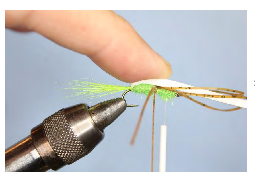
Step 13 Fold the foam over the body.