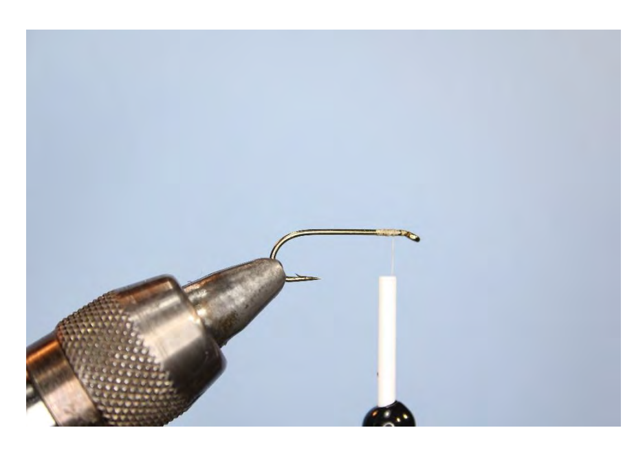
Step 1 Place your hook in the vise. Attach tying thread behind the eye of the hook.