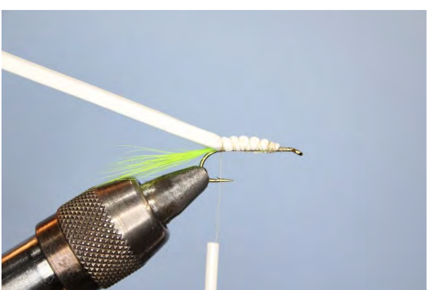
Step 7 Tie in the foam, securing the foam to the shank of the hook. End your tying thread at the bend of the hook.