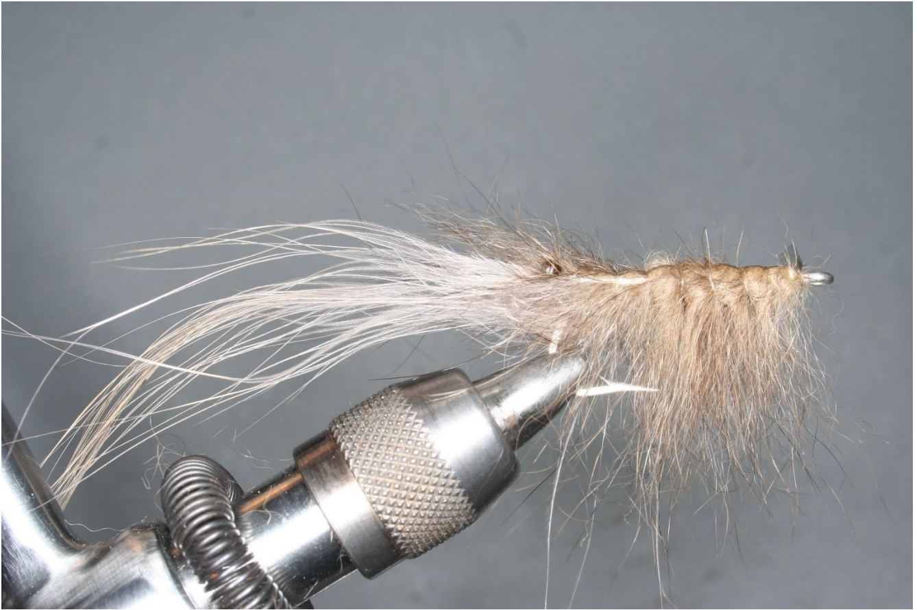
Step 14 Whip finish.