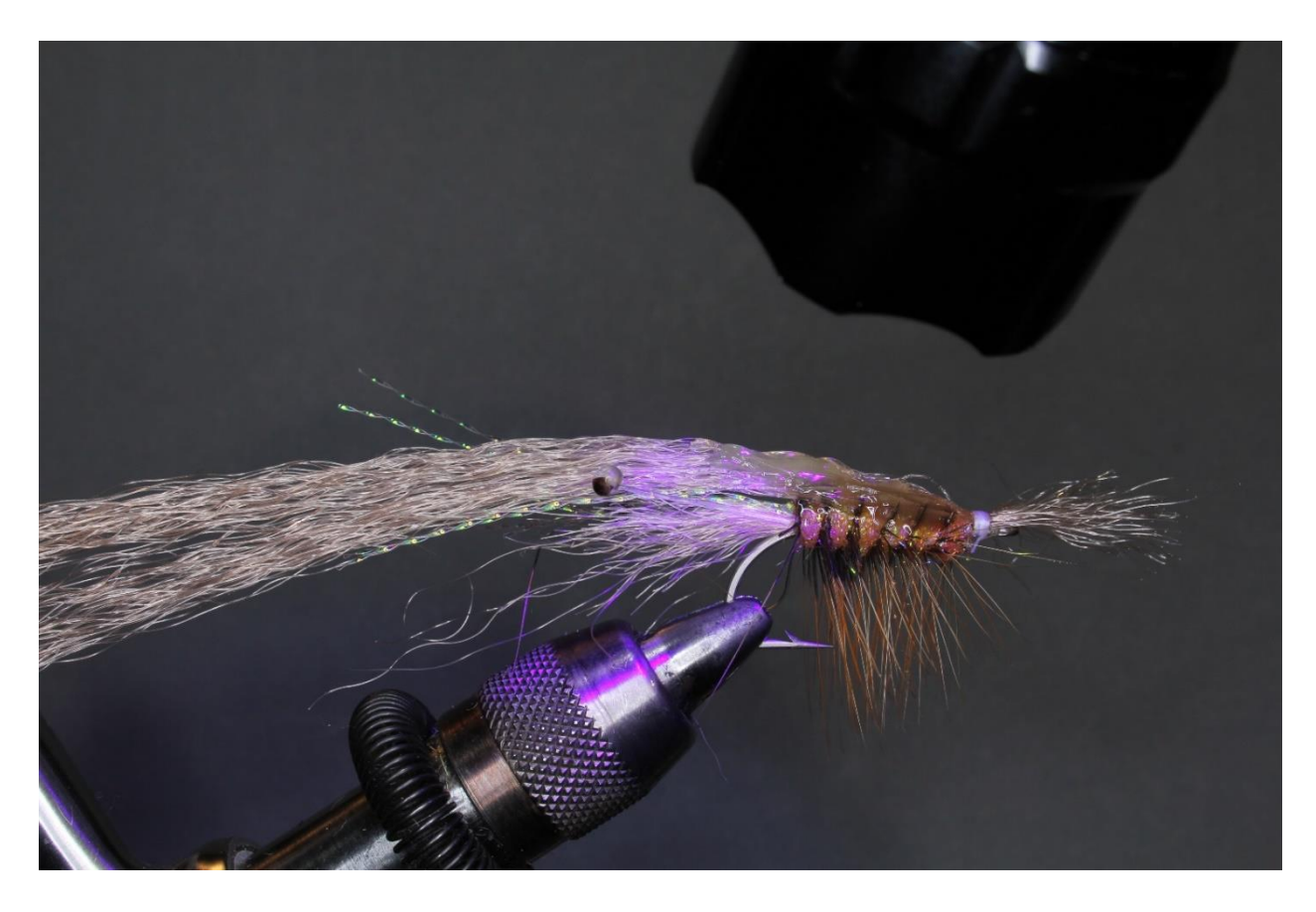
Step 20 Once you have the desired shape and thickness of your shellback, use the: UV lamp and cure the Solarez.