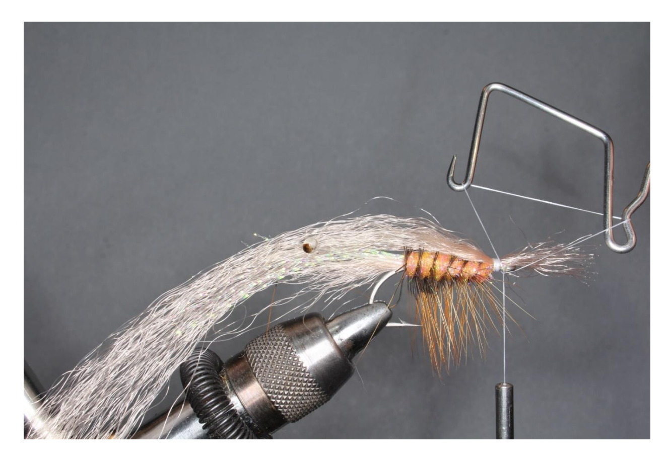
Step 17 Whip Finish and cut the thread.