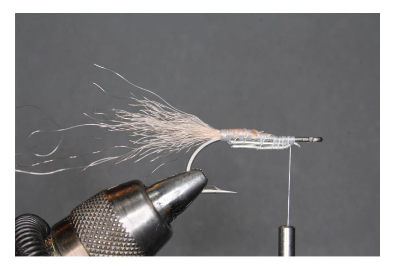
Step 7 Here is the second strip of lead free wire secured to the bottom of the shank of the hook.