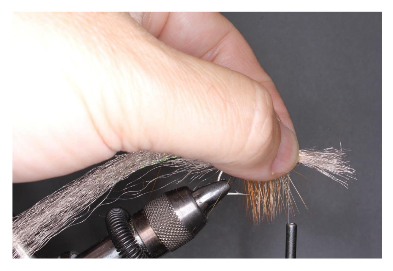
Step 16 Tie the back of the shrimp using either EP Fibers, I am using Super Hair. Extend part of it past the eye of the hook for the tail.