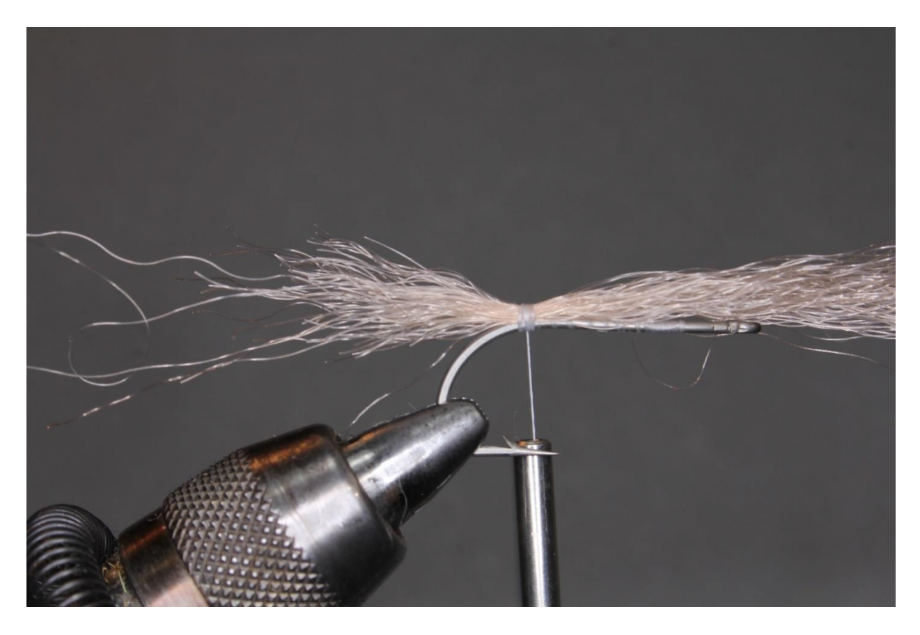
Step 3 Leave some long and short fibers past the bend. Wrap your thread towards the middle of the shank of the hook.