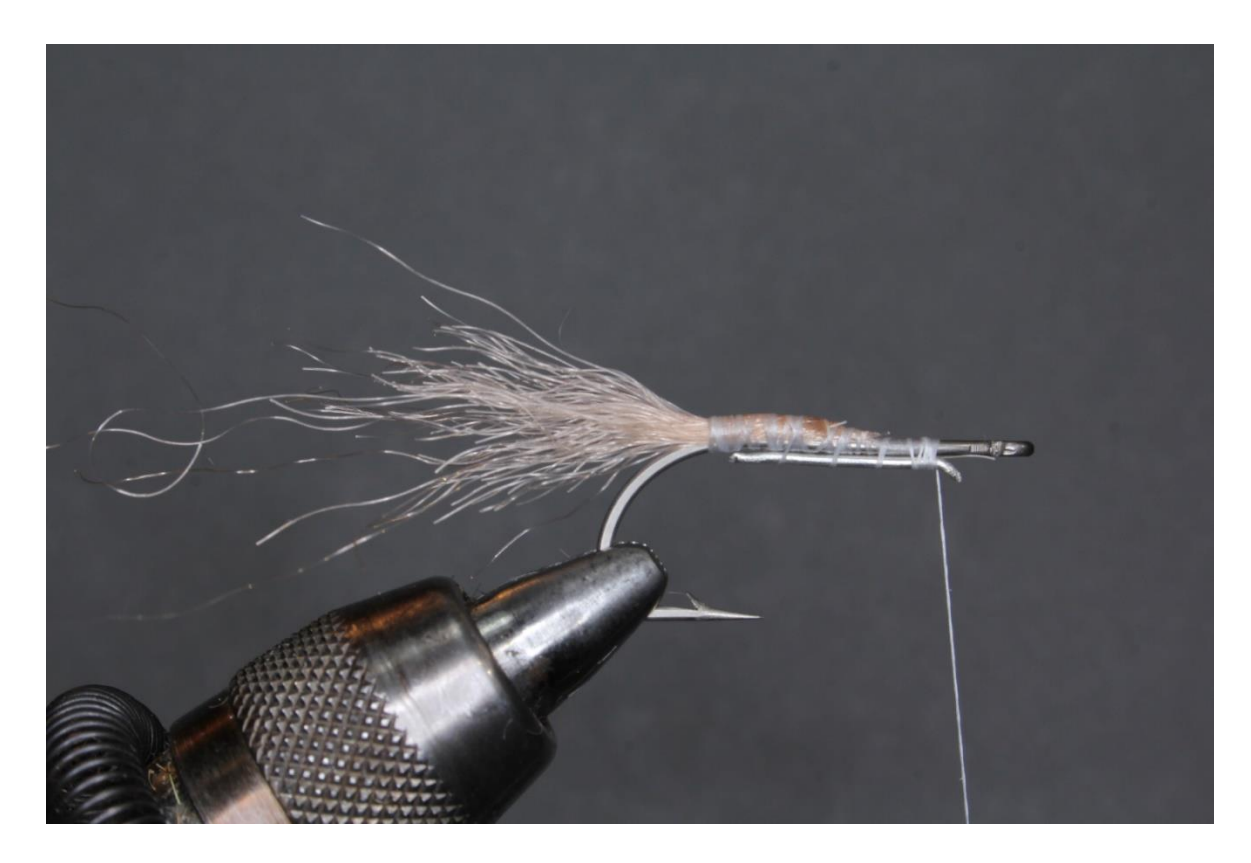
Step 6 First strip of wire added to the bottom of the shank of the hook.