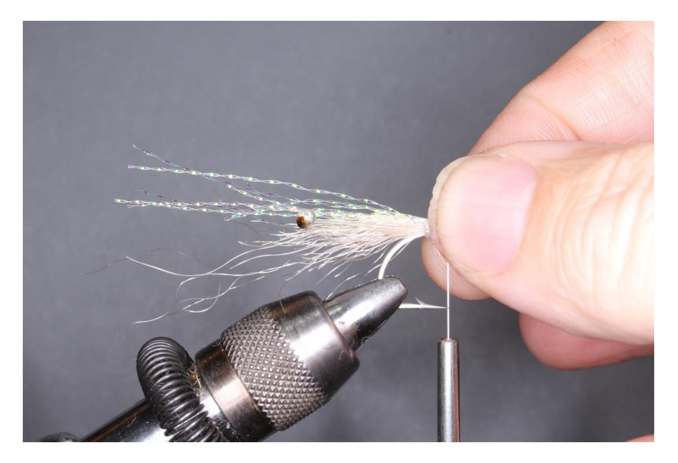
Step 11 Tie the eyes on each side of the body. Eyes should extend past the bend of the hook.