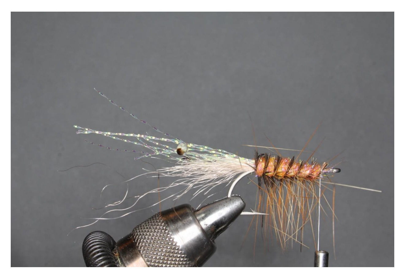
Step 15 Trim hackle on the top of the body.