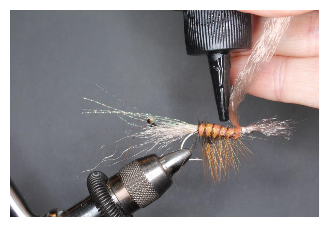
Step 18 Add a coat of UV Resin to the back of the body.