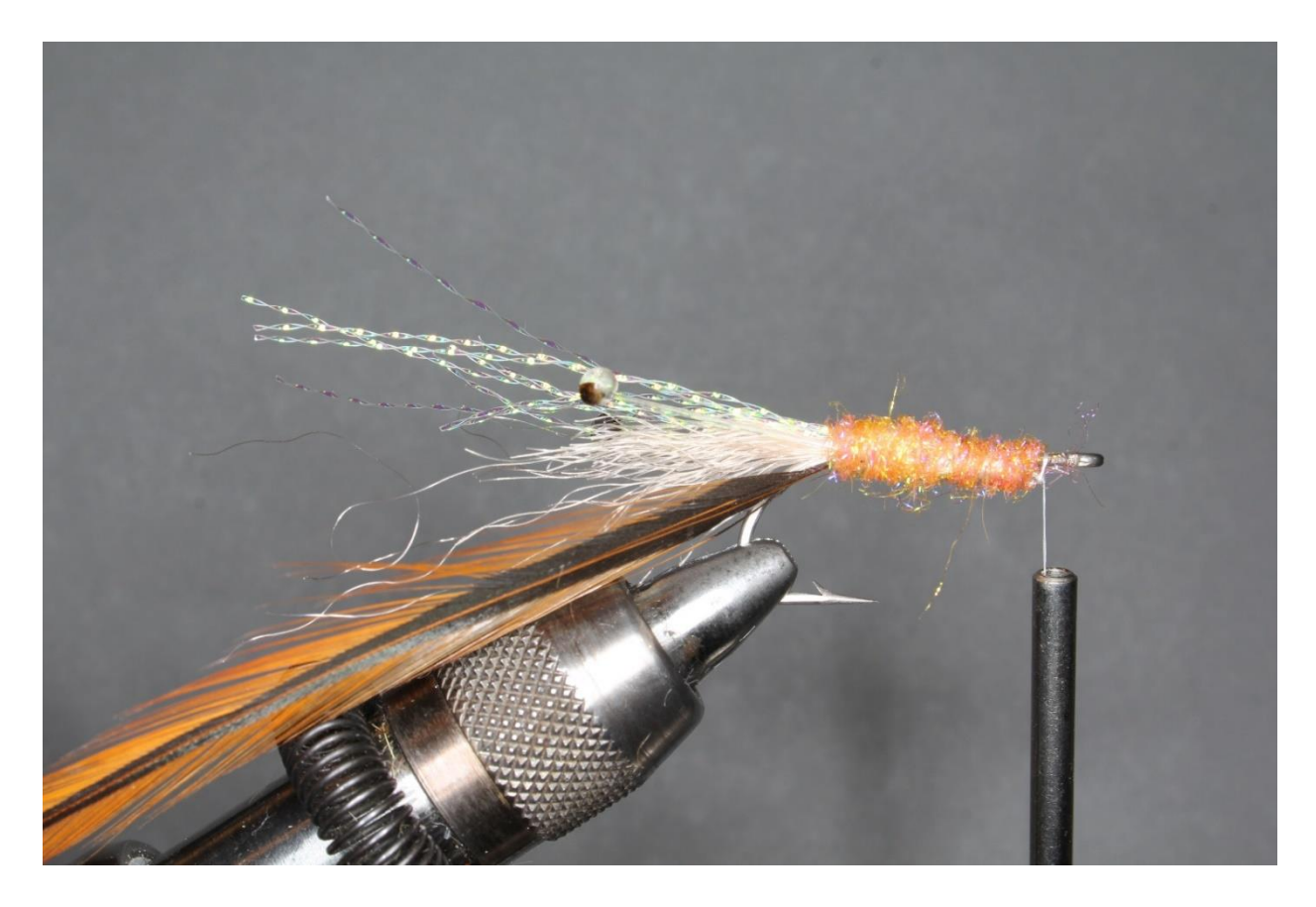
Step 13 Dub a reverse taper body. I am using Shrimp UV Ice Dubbing.