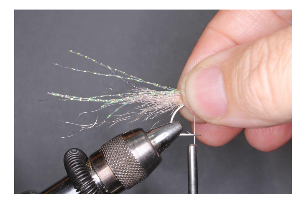
Step 8 Add a few fibers of Pearl Krystal flash for flash.