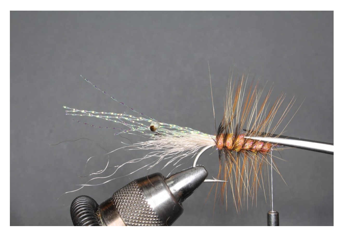
Step 14 Wrap the hackle through the body using even spacing.