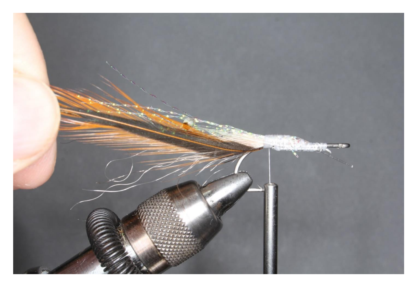
Step 12 Tie in a brown or tan hackle for legs at the bend of the hook.