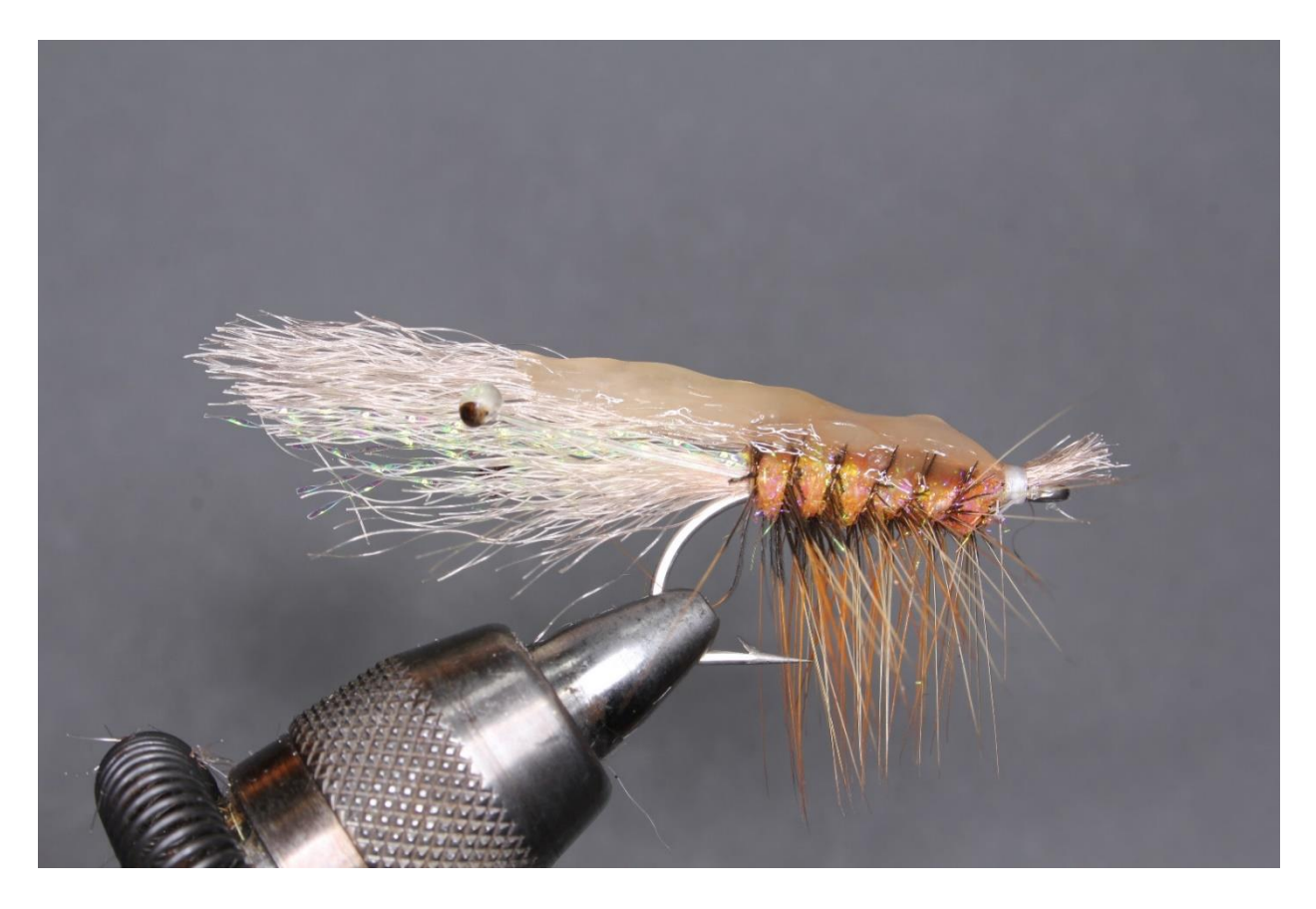
Step 21 Now trim the Super Hair for the length you want. Usually the length is 1 ½ to 2 times the shank of the hook.