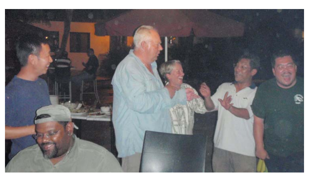
The Aussie barbecue on the last night (Continued on page 16)