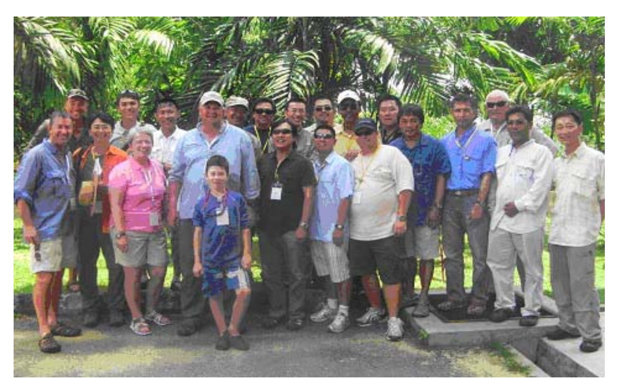
Successful candidates and examiners

Given the success of this event, The organizers of the Malaysian event are discussing having an FFF style Conclave next year. It will be called the Pan-Asian Conclave and include FFF members from Japan, Korea, Singapore, Australia, Indonesia, and Taiwan. With typical Malaysian hospitality, they invite all those who are interested from anywhere in the world to attend. Jungle flyfishing anyone?