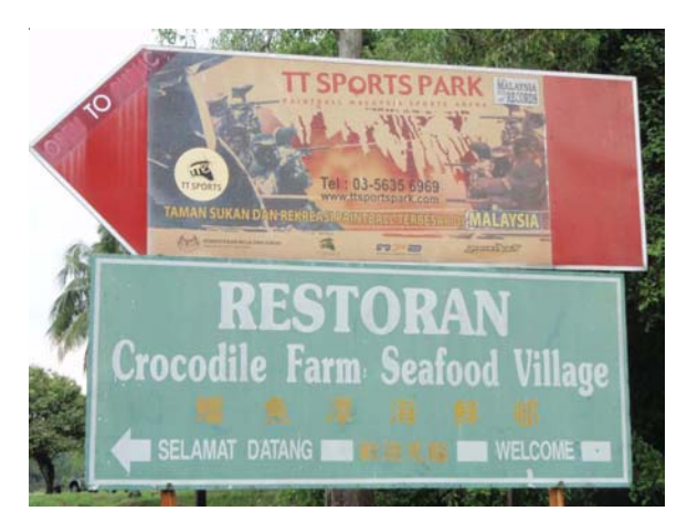
THCI testing in Malaysia - an old lake that used to be a crocodile farm

The article on Malaysia is a huge one! The event itself waslarge with 18 CIs, 3 MCIs and 1 THCI candidate tested. The Malaysian organizers of the event were extremely well organized so everything went well - even candidates has jobs to do. They kept us fed, watered and transported.