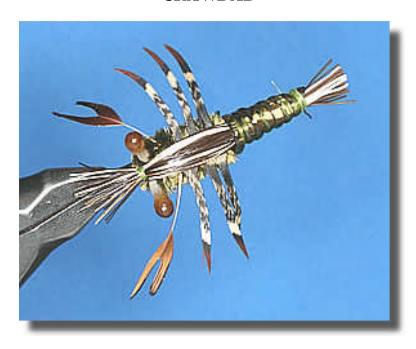
Published by Bob Bates Federation of Fly Fishers - Washington Council